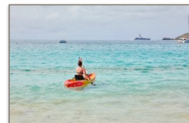
Perfect morning for taking kayaks out for exploring the Grand Bay

During all of the activities we kindly ask you to be thoughtful of marine life. Please do not touch or take out of the water any living being.