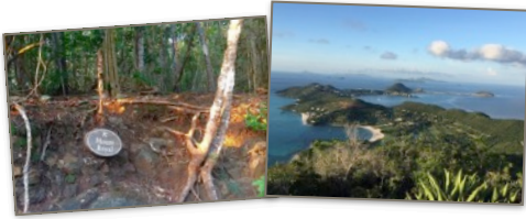
View of beautiful sister islands as seen from Mt. Royal