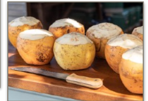
Fresh locally grown coconuts waiting to be tasted