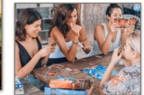
Fun and competitive nights!