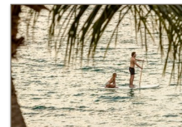
Sunset calls for Stand up paddle in the beautiful, calm waters.