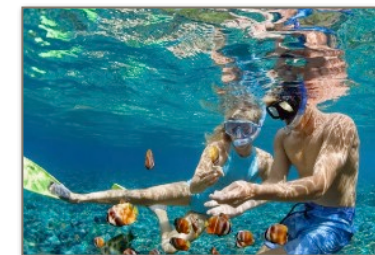
Vibrant reef life.