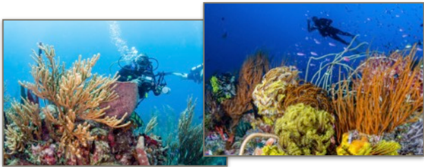
Reefs around Grenadine's waters