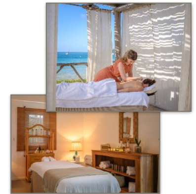
Choose between cozy treatment room and breezy outdoor cabana

If you feel like you have done it all, think again! From CBD oil massage to signature massages, and with a combination of holistic and reflexology that will leave you feeling like a new person, our Canouan Cowshed is unique to its location. Keep an eye out for our Spa Therapists, who will pop up and treat you to a teaser whether you are lounging at the beach or liming at the Terrace, as we say in Canouan.