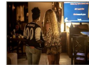
Karaoke night with evergreen hits on repertoire

Have a friendly (or maybe not so friendly) competition with one another and let the best person win! Play familiar board games while munching on Chef's choice of snacks.