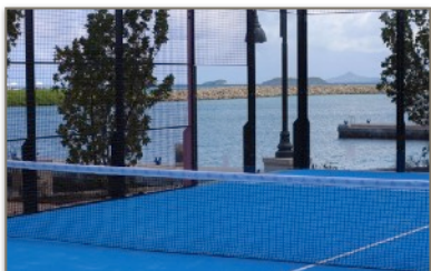
Padel tennis court at Sandy Lane

Padel Tennis, one of the fastest growing sports in the world, is played in an enclosed court approximately half the size of a normal tennis court using a solid padel racket and a slightly depressurized tennis ball. The ball can be played off walls similar to squash.