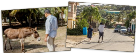
Fun encounters with some four-legged friends

Get to see the Village lifestyle while walking and contributing to our "Green Initiative". Be prepared to run into many tortoises, goats, dogs and wonderful butterflies.