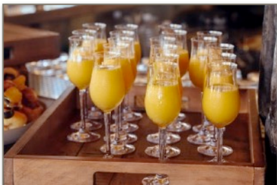
Mango & passion fruit mix

Fresh daily juices also available - From watermelon, passion fruit or pineapple we enjoy our mixologist's surprises daily.