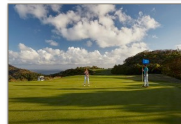
Golfing overlooking pristine waters