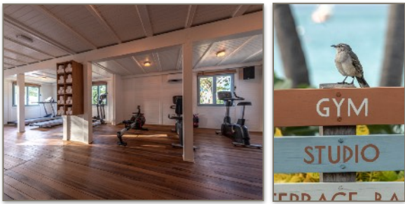
Spacious, bright and air-conditioned gym