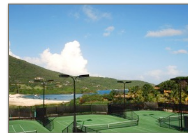
Tennis Courts at just to minutes distance by car or bike

The tennis center offers three Astro- Turf tennis courts also lit for night play with a pro-shop on site, rental equipment and resident tennis professional available for lessons or hitting during select months of the year. Phenomenal views of mountains on one side and sea on the other will leave you breathless even if the hitting doesn't.